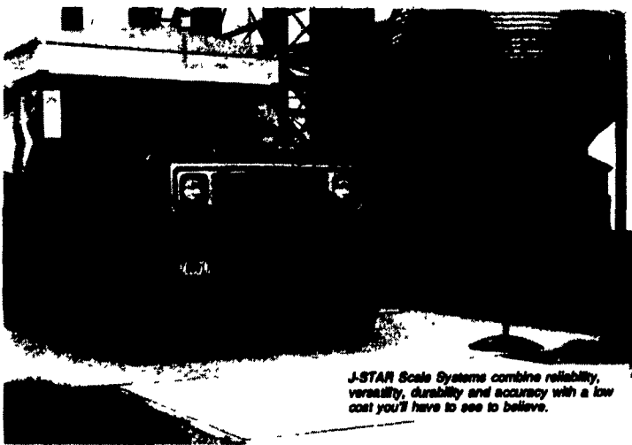
J-STAR Scale Systems combine reliability, versatility, durability and accuracy with a low cost you'll have to see to believe.

A Scale System Priced & Designed For The Farm