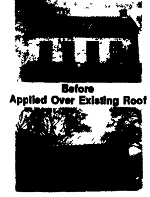
Before Applied Over Existing Roof

PO Box 231 Rehrersburg, PA 19550 (717) 933-4666 (717) 933-5305 (717) 933-5174