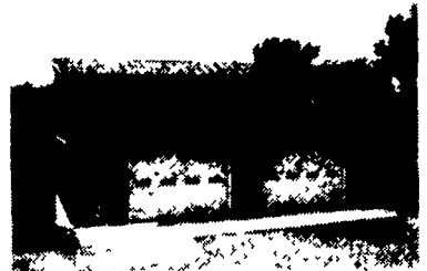
Use On Garages, Horse Barns, Etc.