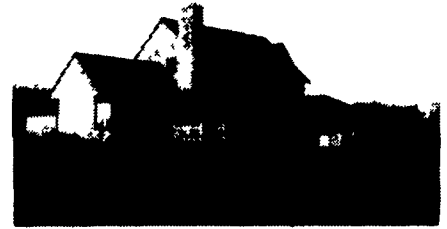
Good For All Roof Angles