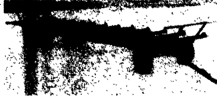
Available in 24' & 30' Lengths