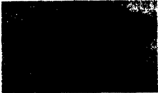
Trailer Models 250, 340 & 430 cu. ft.