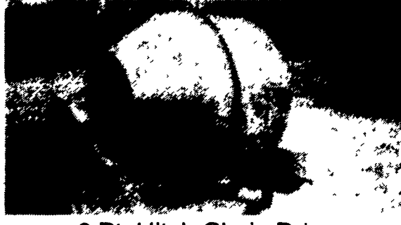
3 Pt. Hitch Chain Driven