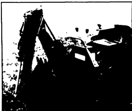
with WOODS compact utility backhoes!

Woods models RB6/7 designed for tractors rated up to 40 hp or 4000 lbs. gross weight... Change angle, tilt, offset and reverse.. for scraping, ditching and plowing.