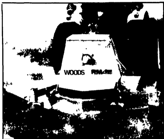
with WOODS rear mount lawn mowers!

Woods box scrapers are available in light duty, Model BB4, BB5 and BB6... and medium duty Models BB600 and BB700. Choice of 4 ft., 5 ft., 6 ft. and 7 ft. cutting edge for tractors rated 20 to 60 hp.