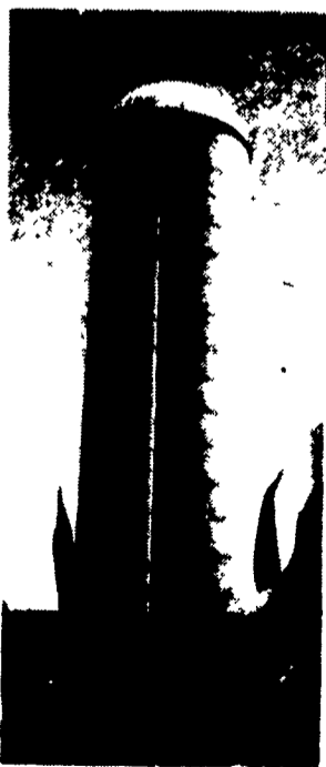
"This is The Kind Of Silo You Need For This Fall's Corn Silage!"