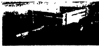
UT-8 Tilt, 66"x8'