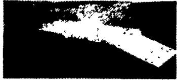
UT-16 Ramp, Tandem Axle 76"x16'