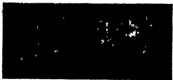
UT-10 Tilt 76"x10'