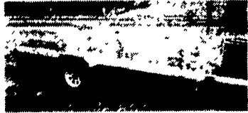
UT-12 Tilt, 76"x12'