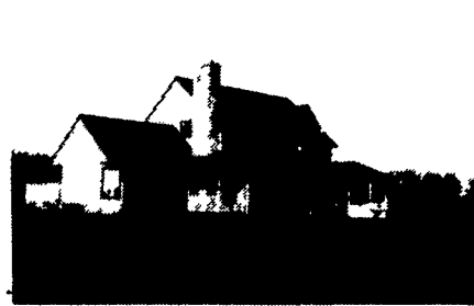
Good For All Roof Angles