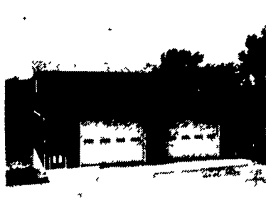
Use On Garages, Horse Barns, Etc.