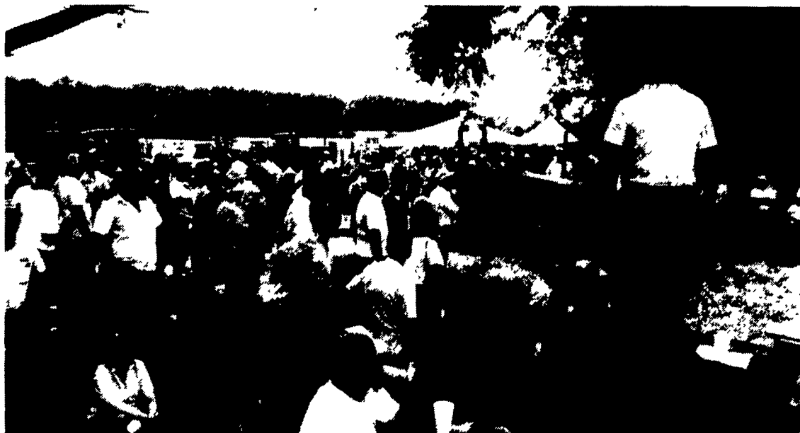
They talk farming here.