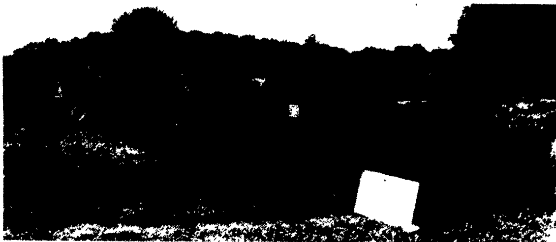
A row of John Deere antiques.

Officials estimated attendance at 400 during the day-long show. (Turn to Page A24)