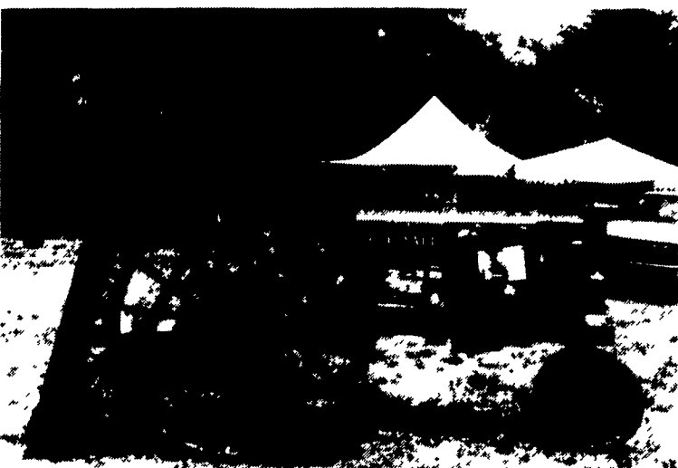
Remember the Farmall F-12.