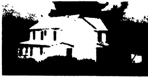
Needmore, Pa.-Fulton Co. $198,000

12 Acres - 4 BR home, new 50'x200' L shaped bldg. Ideal for horse operation or contractor. Trout stream, very private & secluded.