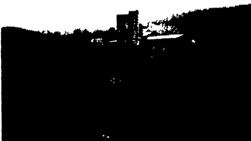
Huntingdon Co. 218 Ac. - Good Production Farm, 57 Stanchions with pipeline, 105 Free stalls + 3 silos. $380,000.

Huntingdon Co. 87 Acre General Farm, 20 acres tillable, balance woodland. House, bank barn & pond. 3 miles south of Three Springs, close to Lake Raystown. $140,000.