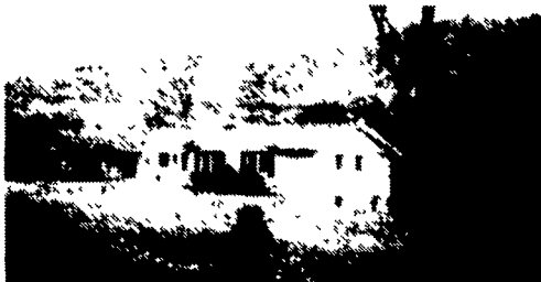
Orbisonia, Pa.-Huntingdon Co. - $159,000

119 acres-Approx. 70 tillable, trout stream, good hunting. Downstairs newly renovated. At end of twp. road, private with nice views of mountains. Many outbuildings.