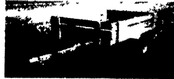
UT-8 Tilt, 66"x8'