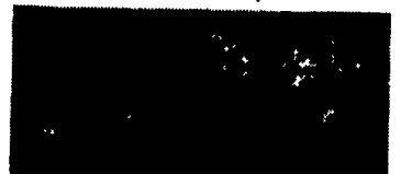
UT-10 Tilt 76"x10'