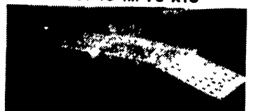
UT-16 Ramp, Tandem Axle 76"x16'