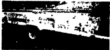
UT-12 Tilt, 76"x12'