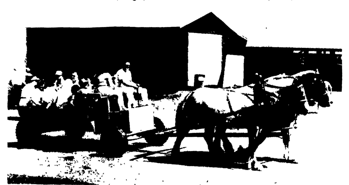
While recently harvested hay fields provided plenty of parking, several teams of Beiglans pulled wagons full of visitors the distance from their car to the hub of Silverlea Farm's activities.