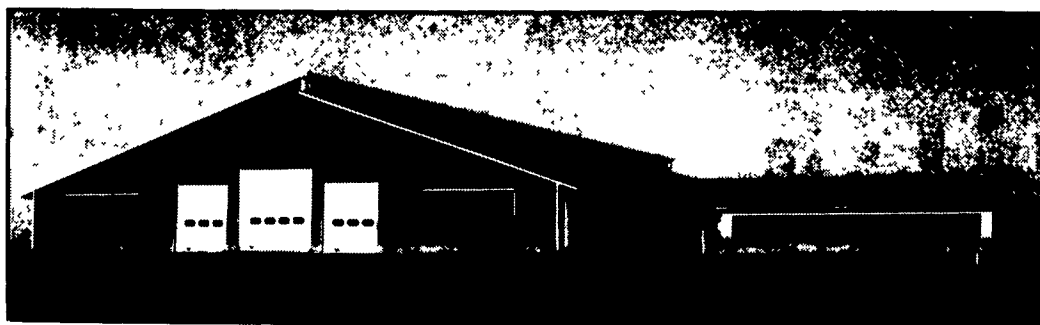
200 Cow Freestall Building