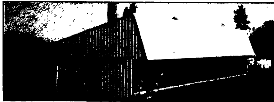
64 Cow Freestall Building