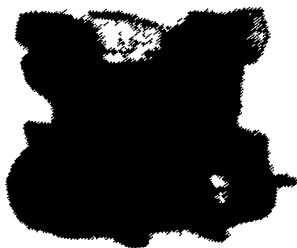
Made in USA