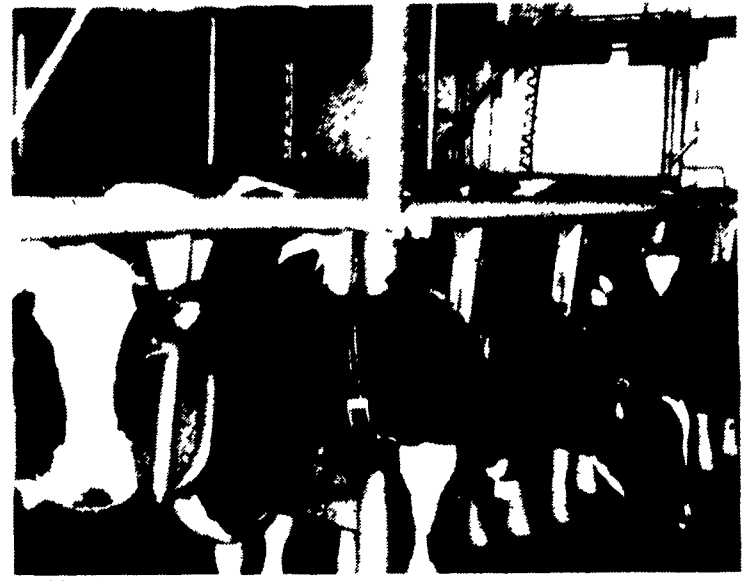
Vertical lift parallel stalls are available from Westfalia, featuring a vertical lift front end for fast release of all cows after being milked. The vertical lift front end indexes to position cows for best milker application.

For more information, contact Westfalia Systemat, 1862 Brummel Drive, Elk Grove Village, IL 60007.