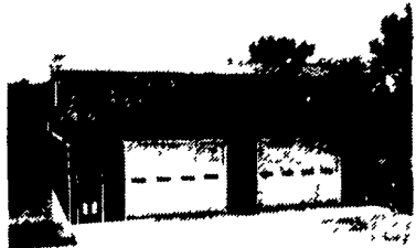
Use On Garages, Horse Barns, Etc.