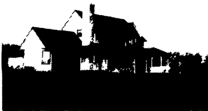
Good For All Roof Angles