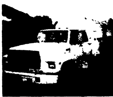
1985 F-600 8.2 Diesel, Auto, 5 Man Cab, Utility With Rollup Door On Rear, Clean, Low Mileage, 1 of 3.