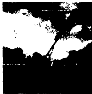
Bucket Trucks 28' to 65' Gas and Diesel. Call For Details.