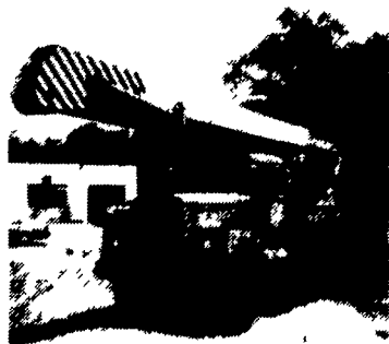
Holan 70' Double Bucket 75' working height mounted on 1981 Western Standard, 6x6 Flatbed, CAT 3208, Auto.