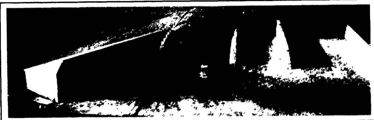
Commodity Bins And Trench Silos

• Retaining Walls • Bunker Silos • Manure Storage, Etc.