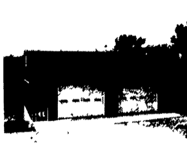
Use On Garages, Horse Barns, Etc.