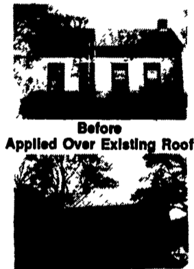
Before Applied Over Existing Roof