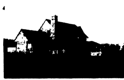
Good For All Roof Angles