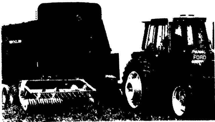
Forage Harvester 790

The heavy-duty Model 790 gives you smooth and efficient harvesting, thanks to the 12 cutterhead knives set at a steeper rake angle and a two-speed blower. The heavy-duty driveline handles up to 150 horsepower.