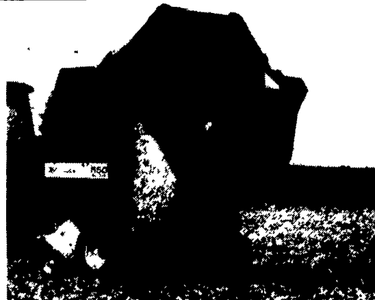
Round Baler - Model 650

The New Holland Model 166 windrow inverter will change the way you make hay - for the better. The Model 166 speeds drying time as it lifts, fluffs and turns windrows without roughing-up the hay.