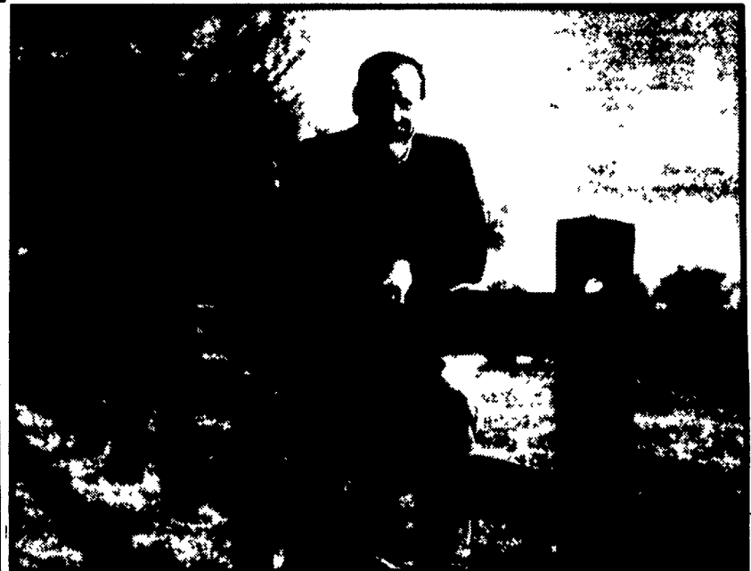
Slip Board, installed 1986

IF IT'S WORTH YOUR INVESTMENT, TRUST IT TO HERSHEY