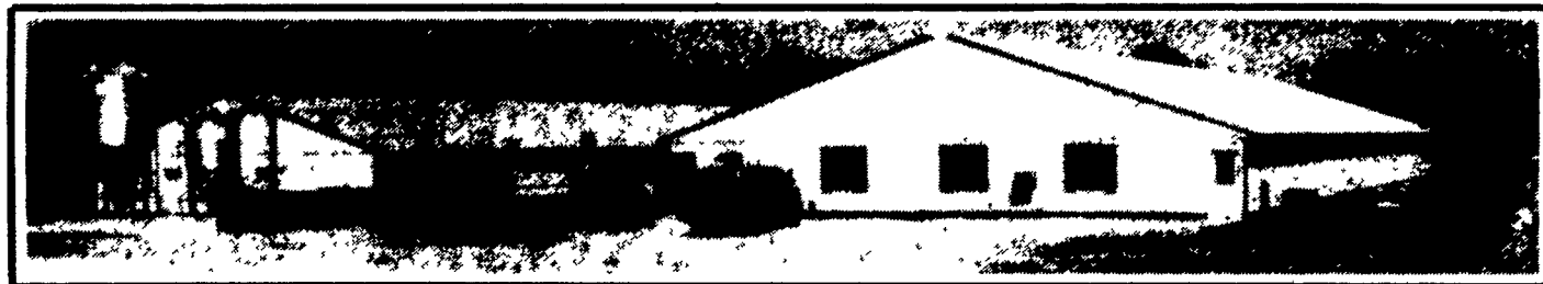
700 Sow Unit