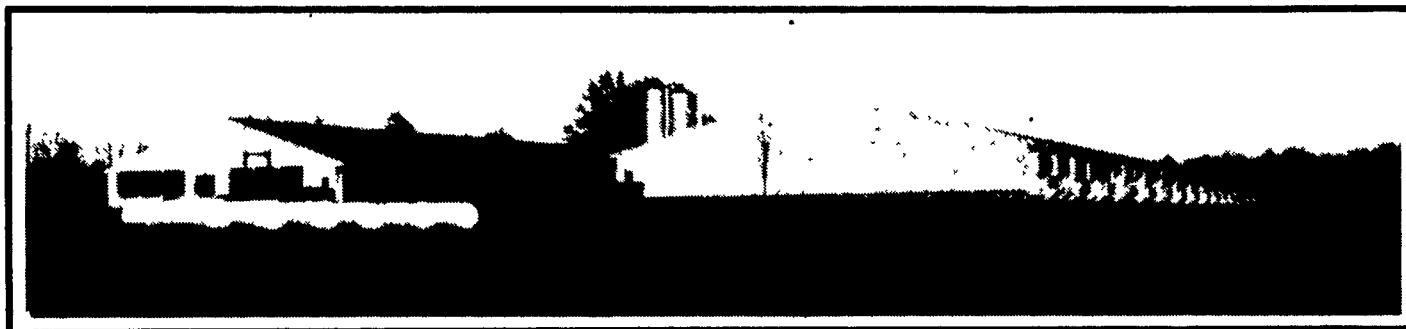
600 Sow Unit