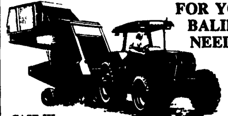
CASE IH 8430 In Stock

WHEN IT COMES TO ROUND BALERS OR SQUARE BALERS SEE BINKLEY & HURST BROS. FOR YOUR BALING NEEDS!