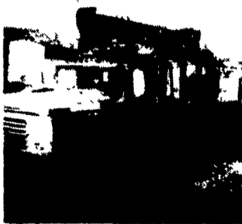
Need a Lift? We Have A Large Selection Of Boom Trucks Up To 14,000 lbs. Cap. Some With Post Diggers.