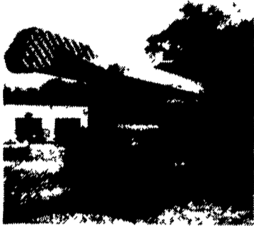
Holan 70' Double Bucket 75' working height mounted on 1981 Western Standard, 6x6 Flatbed, CAT 3208, Auto.