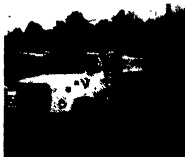
1979 Ford V8 10-Speed, Air, 14,000 Lbs. Boom, 2 Speed Auger, Upper Controls, 4 Outrigger, Dig Holes-Lift-Put Man In Air. This Unit Does It All.