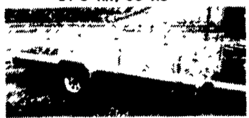
UT-12 Tilt, 76"x12'