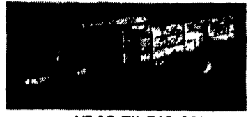
UT-10 Tilt 76"x10'