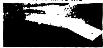
UT-16 Ramp, Tandem Axle 76"x16'