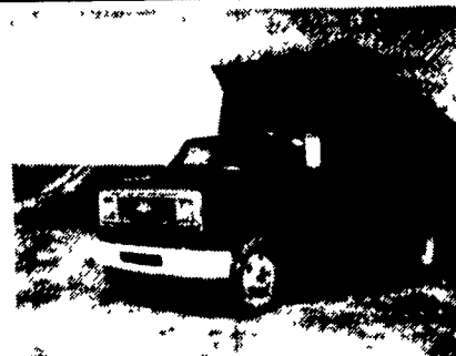
1975 Chevy C60 350 - 2 Speed Rear 12 Foot With Grain Door, Good Condition. M.D. G.V.W. 32,000 717/765-4338

'87 Freightliner conventional, 350, 9 speed, air ride; '76 R model Mack, tandem, 300, PS, wetline, $8500; '76 Chevy 16' dump, 427, 5+2, new motor, $3500; '81 Mack Mid-Liner, 250, 24' reefer body $8500; Mack rear cutoff, air ride. 215-944-9871.