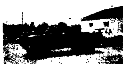
351 V8, 4-Speed, 8600 GVW $7,990

"THE TRUCK PEOPLE" Over 30 Pre-Owned Trucks In Stock!