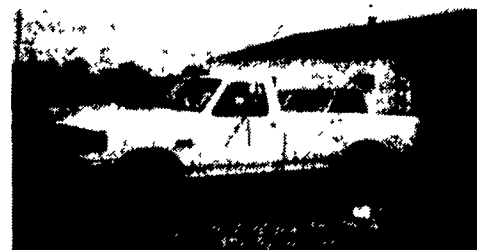
460 V8, Auto, 8600 GVW, New Paint $7,800