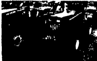
Yanmar 186 4x4 With Loader, Power Shift