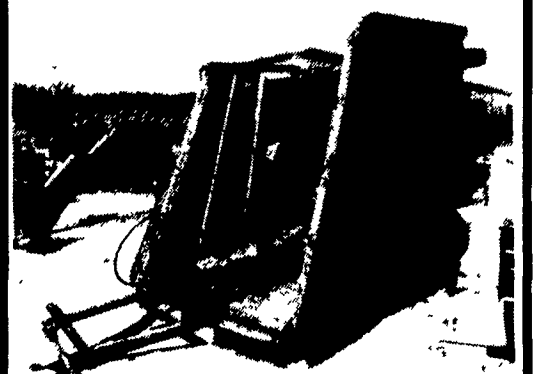
Woods 320 Batwing Mower Field Ready $3,200