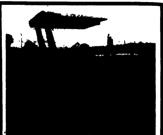
JD 4020 Gas; 2-Outlets, WF $4,000

International 225 Self-Propelled Hay Swather, 10 1/2' Cut, Good Shape and Field Ready. $3800 OBO. Adams County. 301-271-3051.