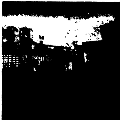
20 Ton P&H Crane 3 Sec. Hyd. Boom mounted on a 1968 F.W.D. both engine gas (new front 89), fleet maintenance.

Huntingdon Valley, PA • 215-672-9667 • 1-800-543-3833 • Eddle