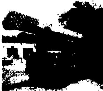
Holan 70' Double Bucket 75' working height mounted on 1981 Western Standard, 6x6 Flatbed, CAT 3208, Auto.