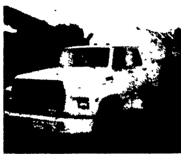
1985 F-600 8.2 Diesel, Auto, 5 Man Cab, Utility With Rollup Door On Rear, Clean, Low Mileage, 1 of 3.