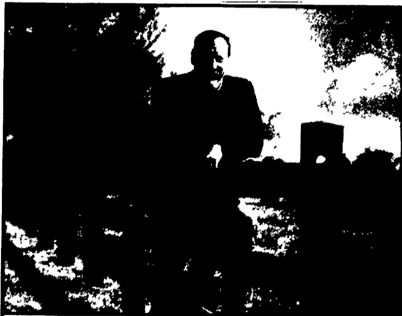
Slip Board, installed 1986