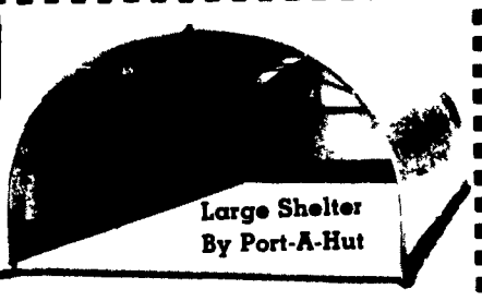
Large Shelter By Port-A-Hut

PORT-A-HUT 14 Peterson Dr., Storm Laka, Iowa 50588 712-732-2546 Manufacturer of quality, affordable hog and calf huts since 1963.