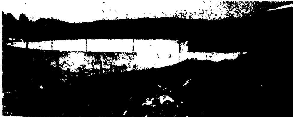
12' x 83' Diameter Circular Manure Storage

Invest In Concrete Quality Work That Will Last A Lifetime