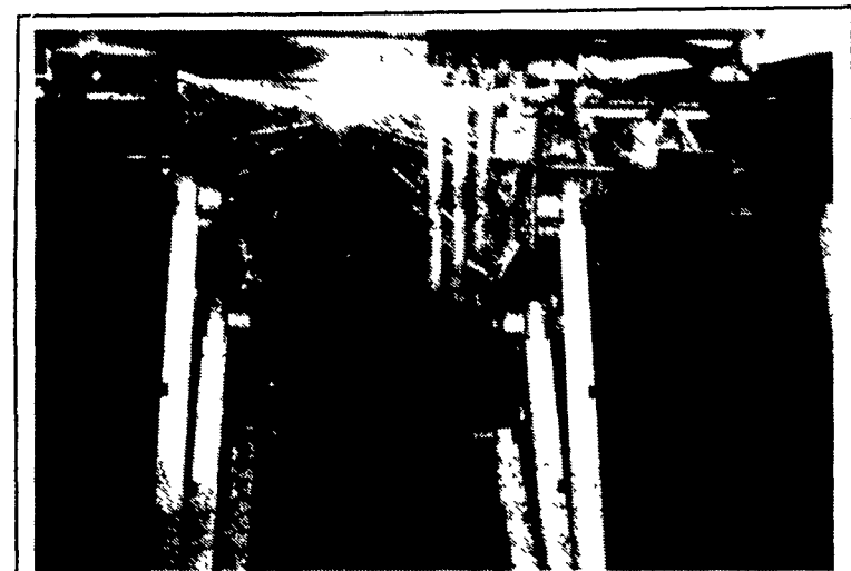
CHORE-TIME 4-high DURACAGE® with CHORE-TIME ULTRAFLO® feeding system and CHORE-TIME soft-touch egg collectors