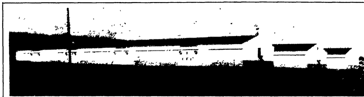
3-81,000 bird CHORE-TIME layer cage systems in high-rise buildings

Sperry Farms purchased their first new 81,000 layer CHORE-TIME cage system with a CHORE-TIME ULTRAFLO® feeding system in 1985. Since then Sperry Farms built a total of 3 new 81,000 bird layer houses and remodeled 4 existing flat chain houses to 70,000 bird CHORE-TIME cage systems with CHORE-TIME ULTRAFLO® feeding systems. Sperry Farms also built a new 81,000 bird 3-high CHORE-TIME pullet cage system with a CHORE-TIME ULTRAFLO® feeding system.