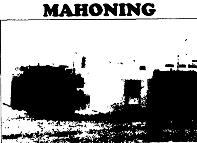
We have a variety of styles & sizes, and one to fit your home/business heating needs!

A Mahoning Outdoor Furnace is a heat exchanger. By running a cold water line from your home to the outside unit, fresh household cold water can be heated and returned to the hot water plumbing in the house. A tempering valve adjusts the hot water at the faucets to a range of 120° to 160°. This boiler system will adapt to any existing plumbing. Heat your pool & hot tub with energy generated by a Mahoning Outdoor Furnace! For more information see your nearest dealer.