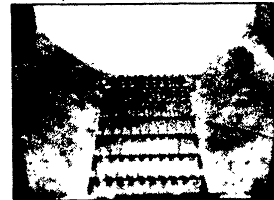
Shaker Grate with Exterior Shaker Handle makes ash removal easy.

LOOK TO MAHONING OUTDOOR FURNACE FOR EASY, WARM INEXPENSIVE LIVING!