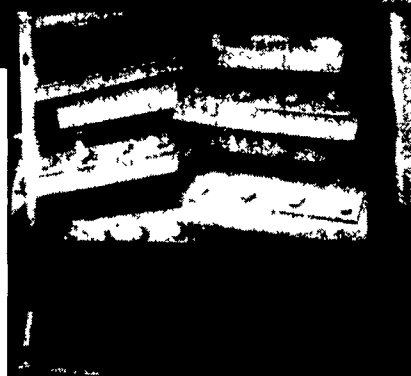
The unique cutting cylinder is the heart of the Jaguar 695 .