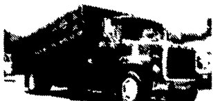
1976 Ford LN7000 18' Stake Dump 3208 Cab, DSL, 5/2 Spd., PS, AB, New PA Inspection, Ready To Go To Work.

Just Off I-78, Between Allentown & Quakertown Financing Pre-Approved