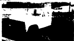
Ford F350 Cab & Chassis 351, V8, 4 Spd., PS, PB, 11,000 GVW, Several To Choose From ..... $3,950 Ea. With New Stake Body ..... $4,950

TWO ACRES OF ALL TYPES USED TRUCKS. "IF WE DON'T HAVE IT, WE'LL GET IT"