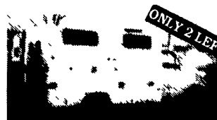
1982-85 Ford E-350, Enclosed Utilities, 351 V8, AT, PS, PB, 7,000 Wat. Water Cooled Generator (Built In) Very Clean Tks Owned & Maintained by Local Utility Co.