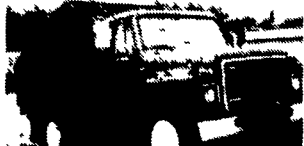
1979 Int $1600, 9' Stake Dump, V8, 4 Spd, PS, PB, 19,000 GVW, No CDL License Required, Parks Dept. Owned & Maintained Since New w/Only 21,000 Original Miles, Exceptional Must See To Appreciate.