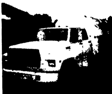
1985 F-600 8.2 Diesel, Auto, 5 Man Cab, Utility With Rollup Door On Rear, Clean, Low Mileage, 1 of 3.