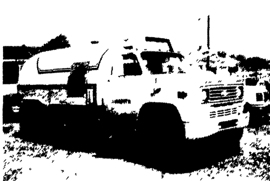
1983 Chev. Vac w/Brush, 8.2 Diesel In Truck, 3-53 In Rear, Good Condition $10,300