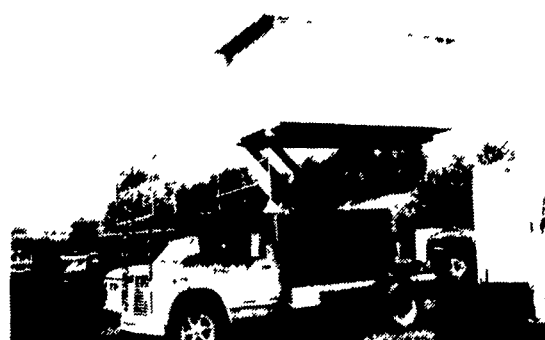
Int. w/High Lift Box in Good Mechanical Condition $2,500

1988 Delux two horse trailer, tandem axle, electric brakes, mats, garaged, excellent condition latest inspection Ches Co 215-286-9275