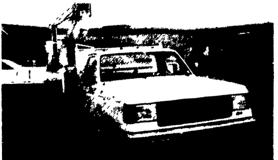
1988 Ford F-350, 351 Engine, 5 Speed, A/C, 5,000 lb. Extendable Crane, PA Inspection, 75,000 Mi., Very Good $9,800