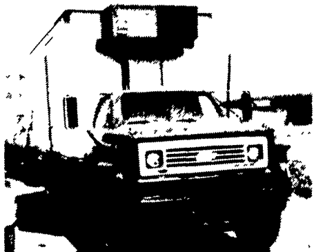
Chev 366 Gas, 5+2, 16 Ft. Reefer w/Standby, Nice Inspected Truck. $6,800