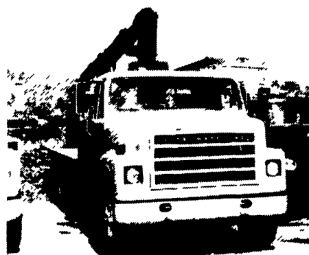
1981 Int. 2275, 300 Cummins, 24 Ft. Body w/Prentice Loader w/Pallet Forks, PA Inspected, Work Ready, Reduced $16,900