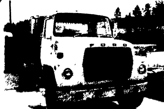
1979 Ford L-800, 429 Gas, 5+2 A/B, 30,000 Miles $4,500

Can Be Used For Cold Storage Inside Or Outside 14'-22' Boxes Starting $3500 And Up 201-663-0243