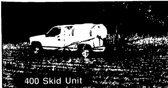
400 Skid Unit