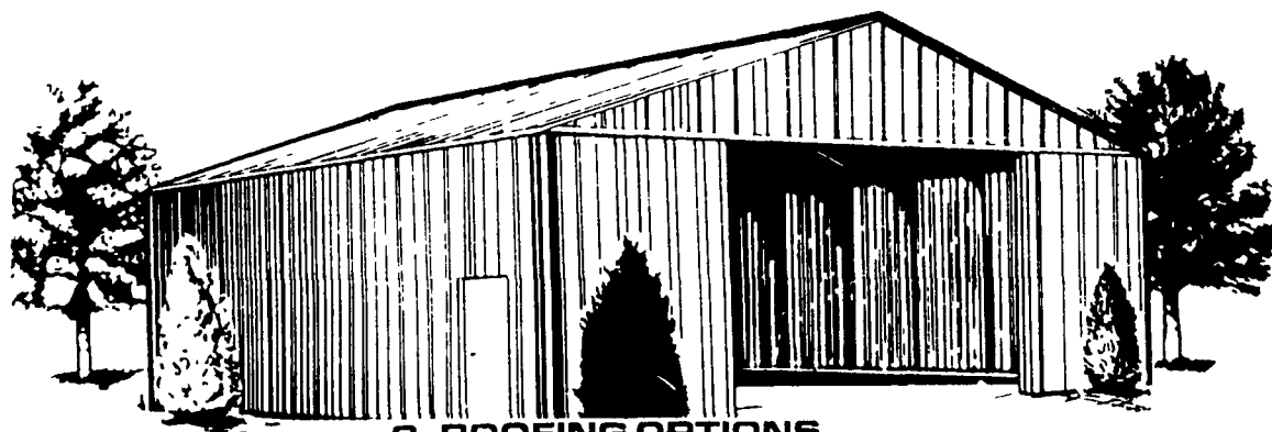
3 ROOFING OPTIONS

CONSTRUCTION • Pressure treated posts & skirt boards • 2x4 Premium grade girts & purlins • Prefabricated clear span trusses 4' On Center • Sliding doors w/National hardware • 3 06 Prehung door • Also includes all nails, hardware, trim, plans and instructions • 29 Gauge Fabral Painted Steel Siding