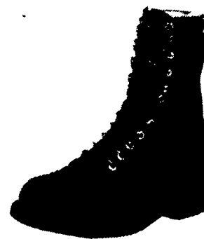
9 inch model 846

NEW HEAVY DUTY SHOE This deluxe shoe features tough long lasting HORSEHIDE LEATHER and feature a rugged Marathon sole. Horsehide is the most durable, acid resistant, leather we know of. Excellent for farm use, construction use or any purpose where rugged and long wear is desired. This shoe features a one piece sole and heel construction, Genuine Goodyear welt and storm welt. Extra stitching at stress points, thick, soft padded collars made of leather, Permafresh cushion insoles and arch supports. Hooks and eyes. Steel shank. Oil resistant soles. Shoes are generously sized. Top Quality American Construction.