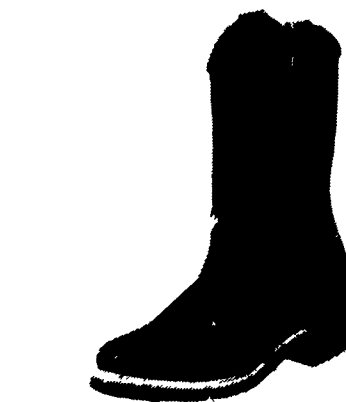
12" WESTERN ENGINEER

Sizes 7-13 including 1/2 sizes D, EE & EEE widths $72.95 _____ As above but steel toe, EE & EEE width $75.95 _____ N.Y. residents add 7% Sales Tax Total _____