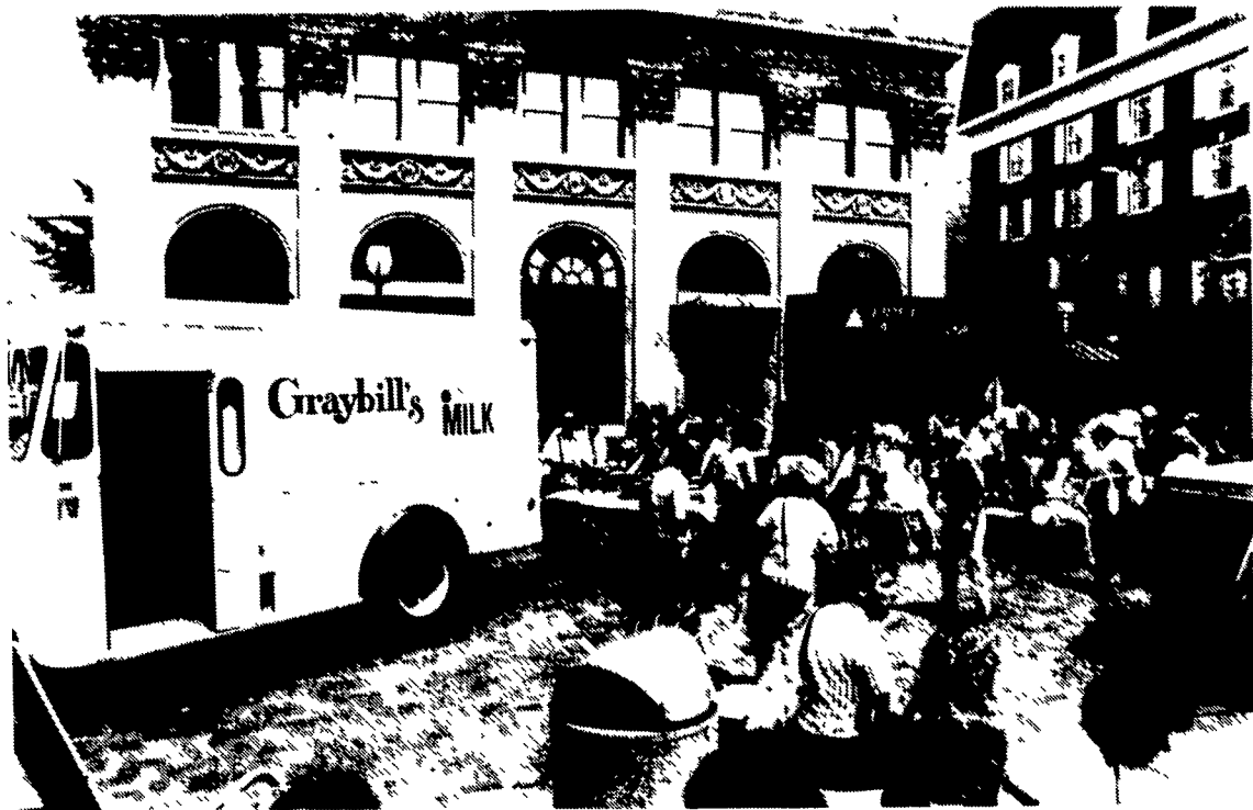
This Graybill's Milk truck is parked on the northwest corner of Lancaster's Penn Square and is one of several dairy product distribution stands for the PDPP Lancaster Dairy Day On the Square promotion.