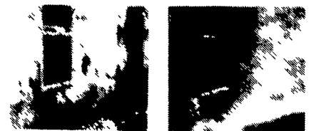
Before The silo's interior with plaster damaged and stave exposed After The surface is reconditioned, and a new thick tough surface will protect stored feed

Shotcrete is also good for repairing stone walls.