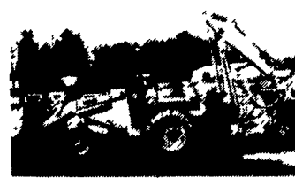
Case 580D, 2WD, ROPS $13,000

R.D. #2 Box 2230 Route 22 Grantville, PA 17028