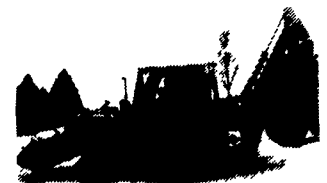
JD 510 Loader Backhoe, Good Condition $14,900