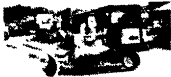
1987 Case 450C Crawler Dozer w/6 Way Angle Blade, ROPS, Sweeps, Excellent Cond. $19,500

RT. 72N, Manheim, PA. 717-664-2444 717-665-2354 FAX 717-664-2835 NEW & USED Farm & Construction Equip.