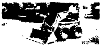
Case 1845C Skid Loader w/Aux. Hydros. Dirt Bucket, New Paint, Excellent Cond. $12,500