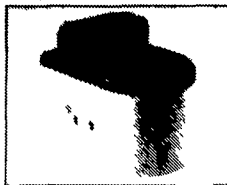
Model CT1 Cattle One-Drink Part No 16271 28" x 20 1/4" x 19" Capacity 50 cattle