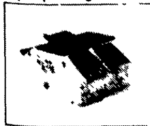
Model HG4 Hog Four-Drink Part No 16260 31 1/4" x 31 1/4" x 8" Capacity 160 hogs