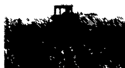
White Row Crop Cultivators are designed for high speed

With nine models, there's a model with the options to match your residue management plans.