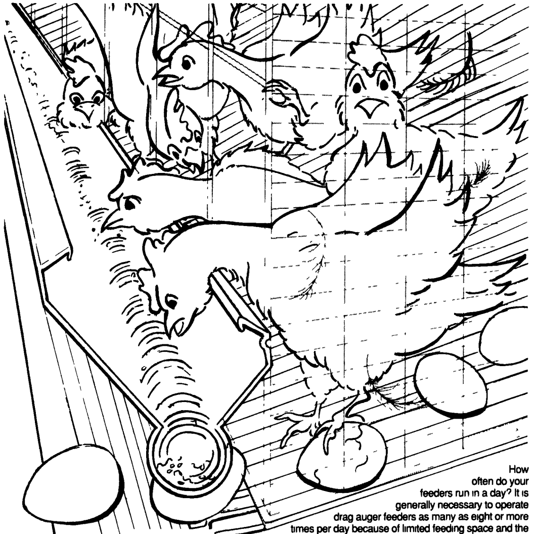
DRAG AUGER FEEDING SCHEDULE?