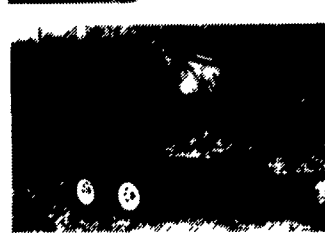
Highway Dumps All Sizes