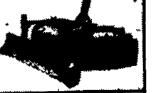
3 POINT SCRAPER