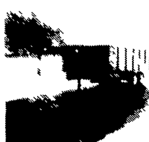
8x16' Gooseneck Dumps

Manns Choice, PA 814-623-8696 or 814-623-9696 Fax 814-623-7995