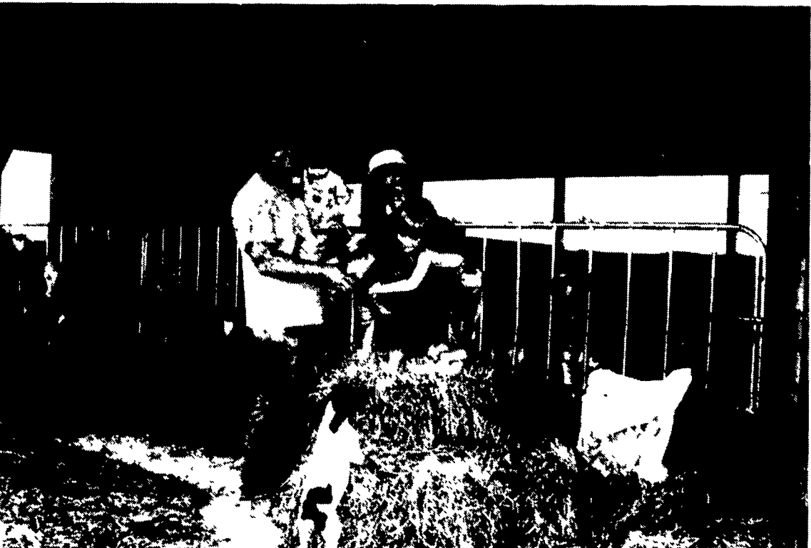
How about a hug? When you give one dog a hug, another one jumps up for a hug too.