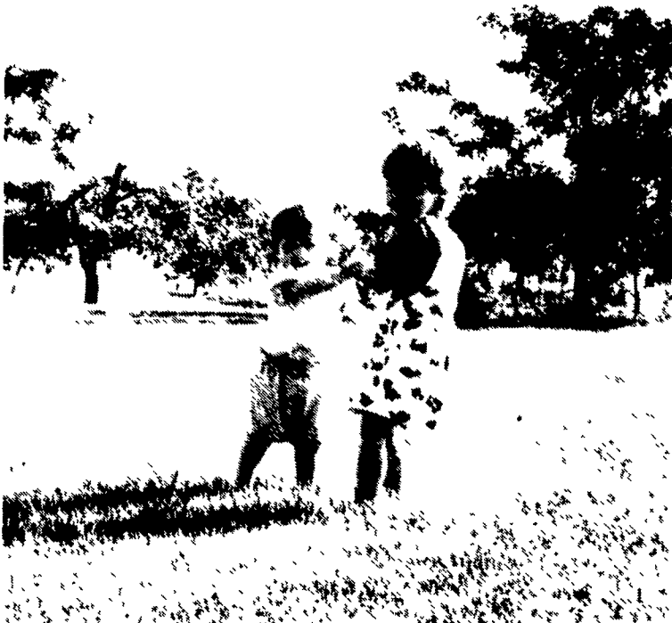
There is plenty of room for Ring-Around-The Rosy on Grandpa and Grandma's farm.