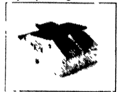
Model HG4 Hog Four-Drink Part No 16260 31 1/4" x 31 1/4" x 8" Capacity 160 hogs