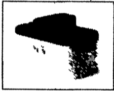
Model CT2 Cattle Two-Drink Part No 16299 42 3/4" x 24" x 19" Capacity 100 cattle