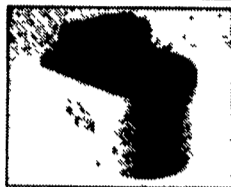
Model CT1 Cattle One-Drink Part No 16271 28" x 20 1/4" x 19" Capacity 50 cattle

Electric-free fountains that live up to the Ritchie® name.