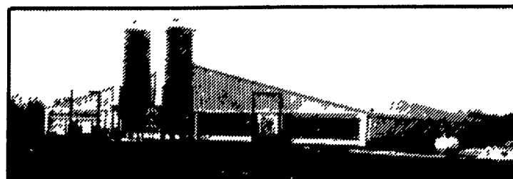
101'x245' 3000 head tunnel ventilated hog finishing house

Contracts available for • Hog finishing: 1,000-3,000 head • Sow units: 200-1,800 sows