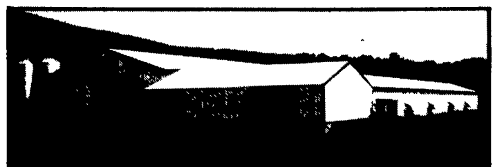
108,864 bird CHOR-TIME, layer house with ULTRAFLO® feeding

Contracts available for • Layer houses: 90,000-126,000 birds