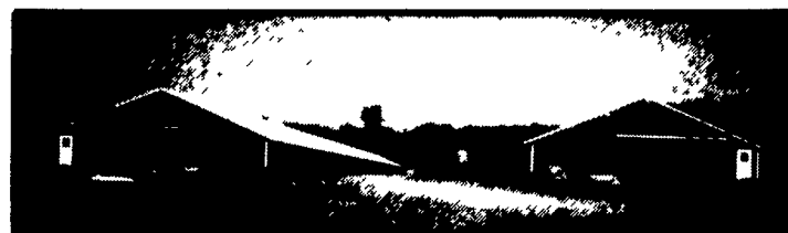
Two 50'x620' tom turkey houses

Contracts available for • Tom & hen turkeys: 7,200-15,000 birds