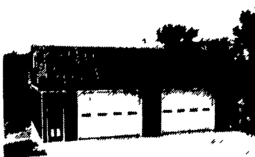
Use On Garages, Horse Barns, Etc.