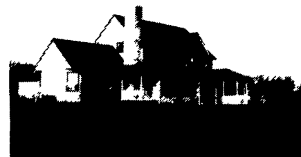
Good For All Roof Angles